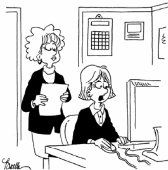
"I really need to diet. I can see my hips on Google Earth."